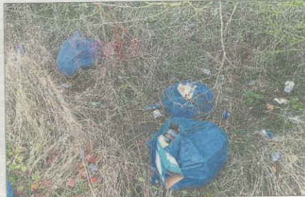
BAGS of fly-tipped rubbish were found in Newark.

"As well as the council's own recycling services and household waste recycling centres, there are plenty of legitimate rubbish removal services