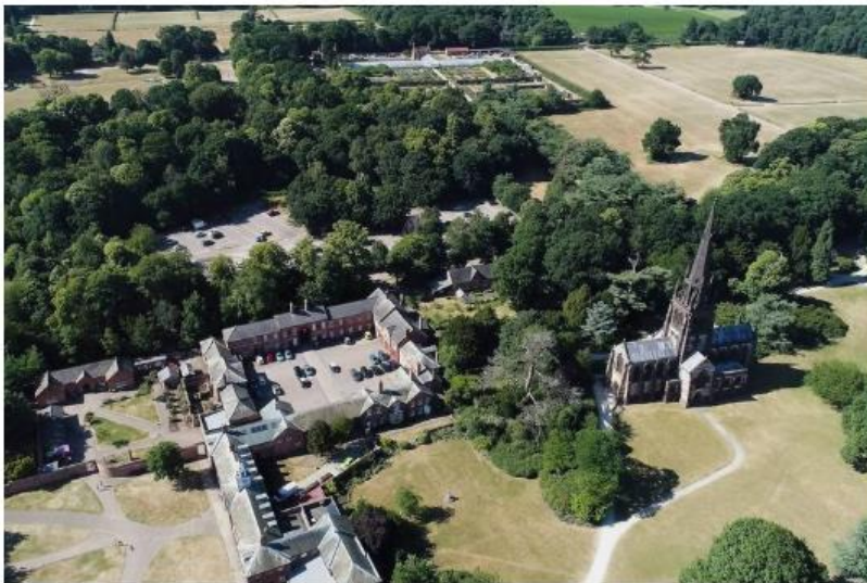
Rubbish was dumped at Clumber Park

Sign up to FREE email alerts from NottinghamshireLive - Daily