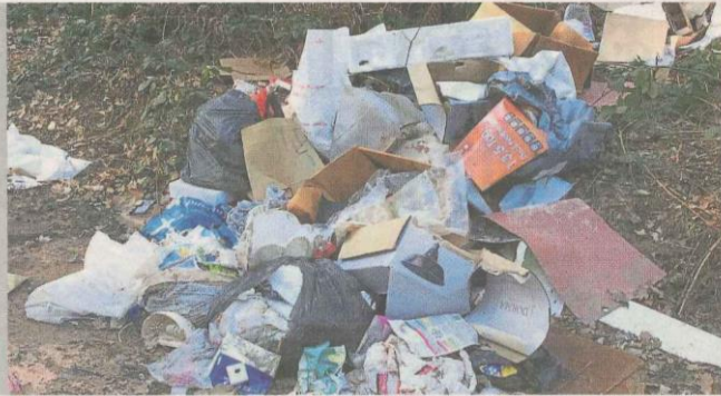
THE fly-tip at Sherwood Pines, which led to the prosecution of a Newark builder.