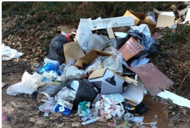
Fly tipping at Sherwood Pines

Sign up to FREE email alerts from NottinghamshireLive - Daily