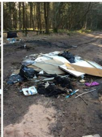
The fly-tipped rubbish at Sherwood Pines.

Sign up to FREE email alerts from NottinghamshireLive - Daily