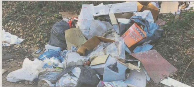
THE offending flytip at Sherwood Pines that was dumped by Corey Batterham, 24, from Newark.

£1,900 fine, £1,000 legal costs and £181 victim surcharge.