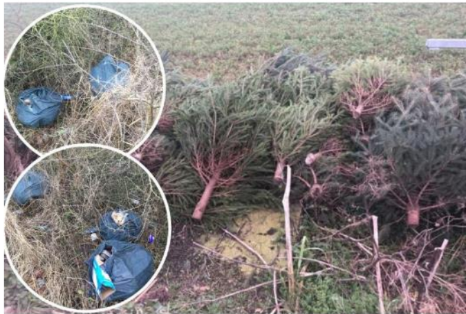
Waste from over Christmas including trees have been found dumped in Newark.

Sign up to FREE email alerts from NottinghamshireLive - Daily